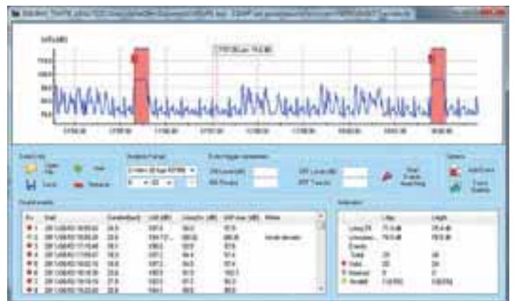
Noise Studio: NS2A “Acoustic Pollution” module; railway traffic noise, 24h analysis with automatic identification of train transits.

Noise profiles detected outdoor, are analyzed in order to search for annoying sources characterized by a sequence of events such as railways and airports. The analysis is performed on a daily basis with a resolution equal to 1/8 of a second and with automated detection and analysis of sound events. This module works on time histories acquired with option “Advanced Data Logger” installed on the sound level meter.